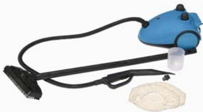
NEW! Everywhere Steamer $99.95

helps to prevent slips and falls and prevents mold spores from growing on carpeting and upholstery.